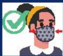
Fit snugly against face and nose with no gaps