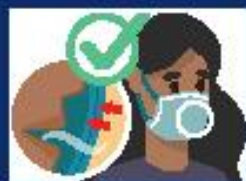
Two or more layers of fabric