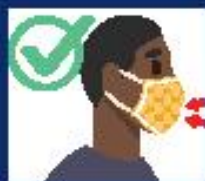
Completely cover nose and mouth